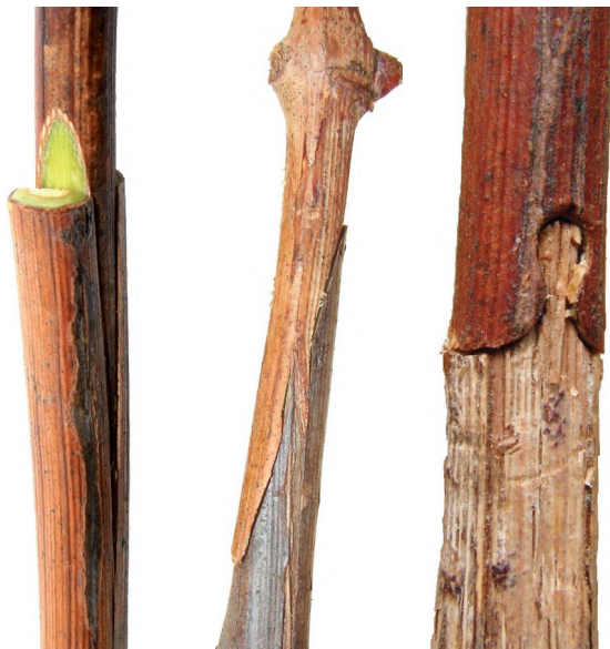
a. Full cleft graft b. Whip-and-tongue graft c. Omega graft

contamination have frequently been observed by researchers along the breeding process in nurseries (hydration, disbudding, callusing, rooting, etc.) 2 . As full cleft grafts are made directly on the rootstocks in the field, these vines are not subject to these “hostile environment” manipulations, giving them a better chance to remain healthy.